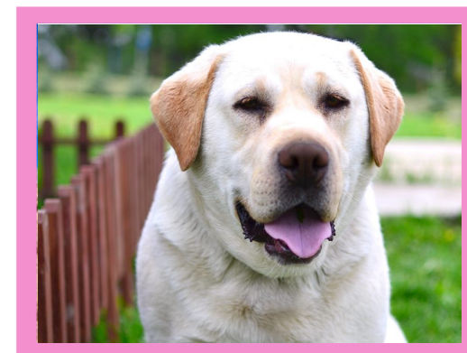
Taffy (Labrador Retriever)